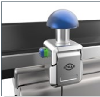
Extra pan handle Extra pan handle allows panning the table from different sides