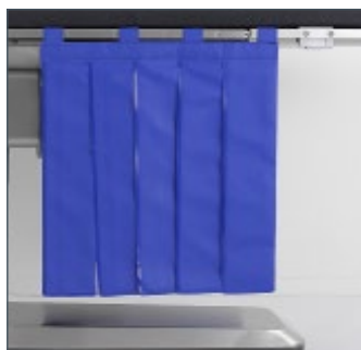
imagiQ2 radiation shield Tailored and easy to fit protection against scattered radiation with lead rubber (0.5 Pb) material.