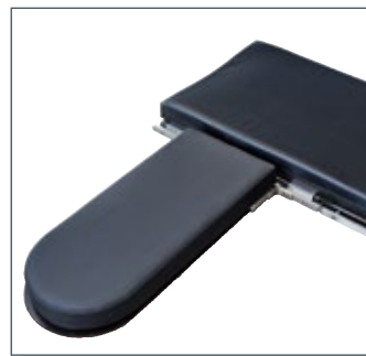
Translucent fistula arm board Provides an unobstructed image and is connected directly to the carbon fiber top.