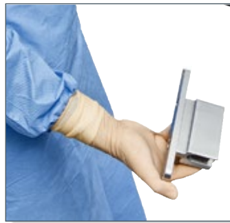
Detachable short side rail Short 8 in / 20 cm rail system enabling accessory mounting and 360° imaging capabilities.