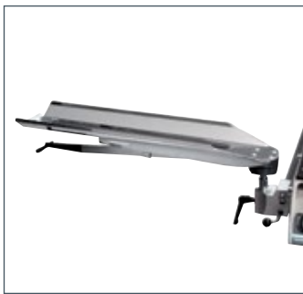
Adjustable arm board Nontranslucent board provides ideal support for the patient's arm during IV.