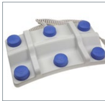
imagiQ2 foot control Compact multipedal footswitch for discrete placement beneath the table with soft touch buttons and a light operating force.

The imagiQ2 offers a large line of accessories for vascular tables and can be upgraded with features and detachable table tops for different purposes when it is needed.