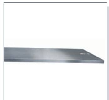
Catheter tray Provides an extended work space, which is attached directly to the table. Available in three lengths.