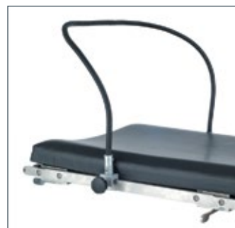
Anesthesia screen Provides a sterile barrier separating the surgical field from the patient's head.